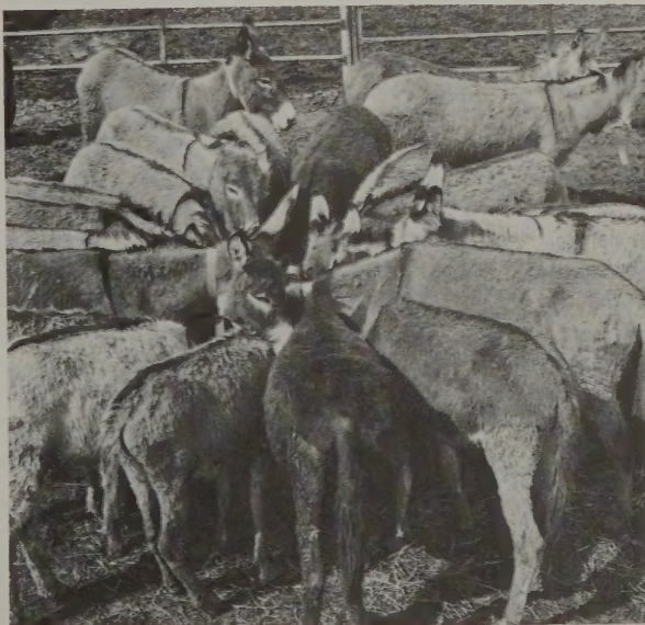
Wild burros are available at most Bureau of Land Management adoption centers, especially those in the eastern and southwestern States.

No. The Wild Free-Roaming Horse and Burro Act applies only to those animals on public lands administered by BLM or the Forest